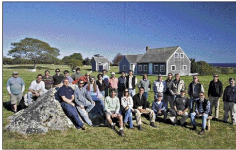
The company gathers for its 2006 holiday card — an annual institution that clients look forward to.

It's worth pointing out that nobody gets